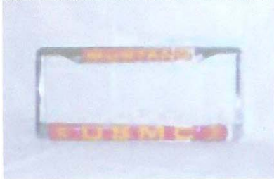
MCMA license plate frame. Metal. A pair will accommodate one (1) car or the rear of two (2) cars