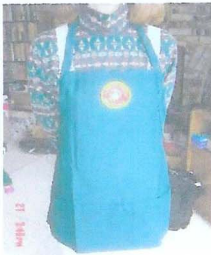
Bar-B-Q Apron, w/three (3) divided pockets