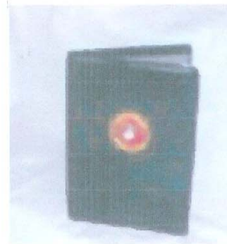
Portfolio w/inside pockets, includes pad and pen holder